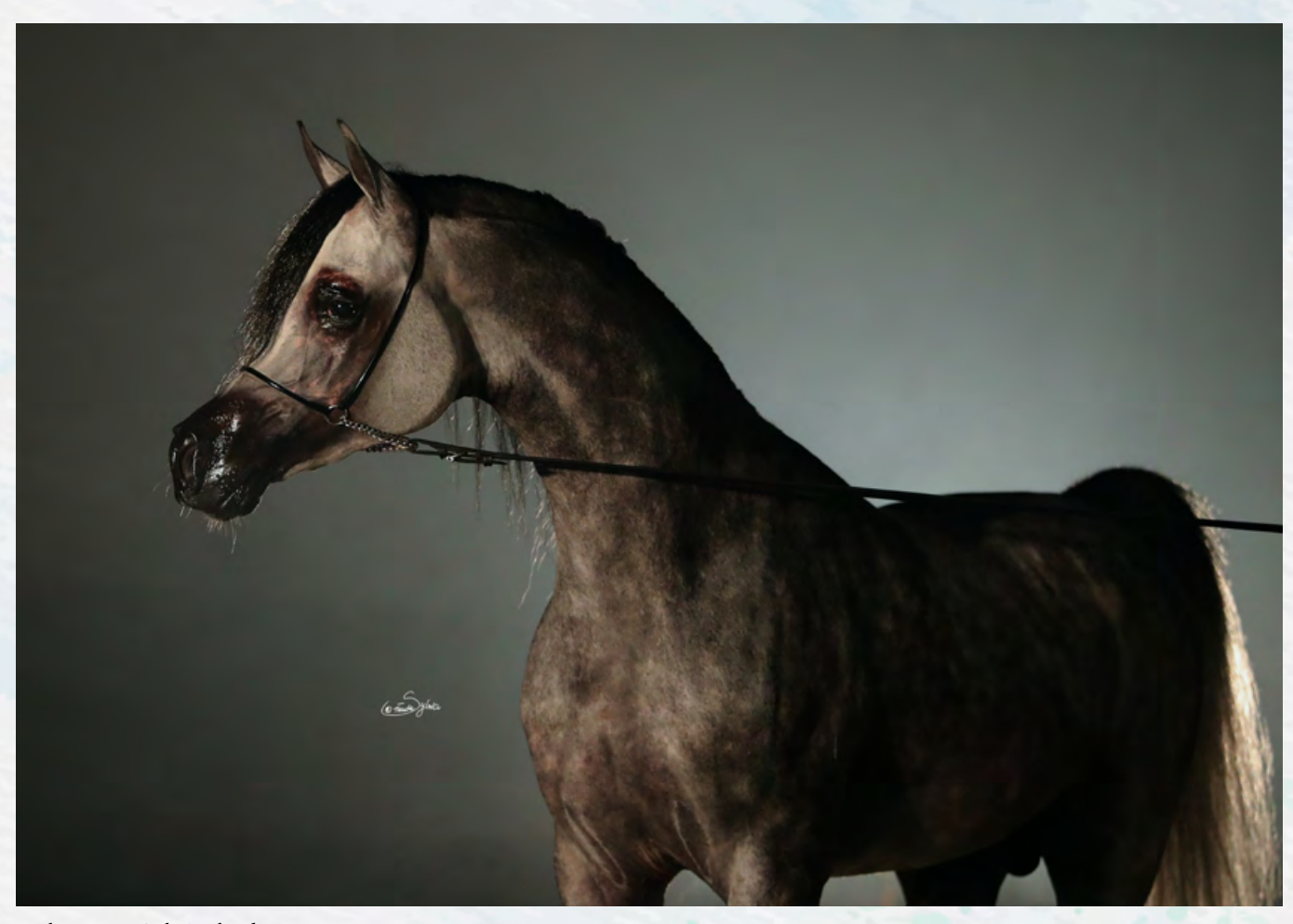
Ptolemeusz - Sylwia Iłenda