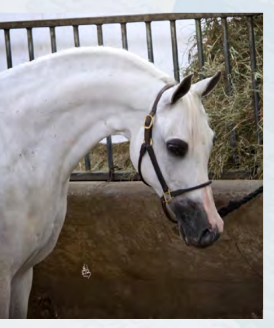
Złota Orda

Dreams / Magic Dream CAHR), the twelve-year-old Michałów-bred stallion represents the royal dynasty commenced by his paternal great-grandsire, 2017 Platinum World Champion Male, Gazal Al Shaqab (Anaza El Farid - Kajora / Kaborr) and continued further by his equally esteemed paternal grandsire Marwan Al Shaqab (out of Little Liza Fame / Fame VF), three times World Champion and a highly influential individual in his own right. Not many Arabian stallions can boast about having three multiple World Champion winners as their direct male ancestors but the more impressive fact is that the number of the most prestigious titles that these three stallions managed to gather over the years is directly proportional to the influence they had on the breed as sires. It is close to impossible to name all the halter show champions sired by these superb stallions but the fact that the three of them produced nine Platinum World title winners is an impressive and inspiring accomplishment which shows the great genetic prepotency of Gazal's family. Gazal himself sired three Platinum World Champion Mares: Pianissima (out of Pianosa / Eukaliptus), Pinga (out of Pilar / Fawor) and Emandoria